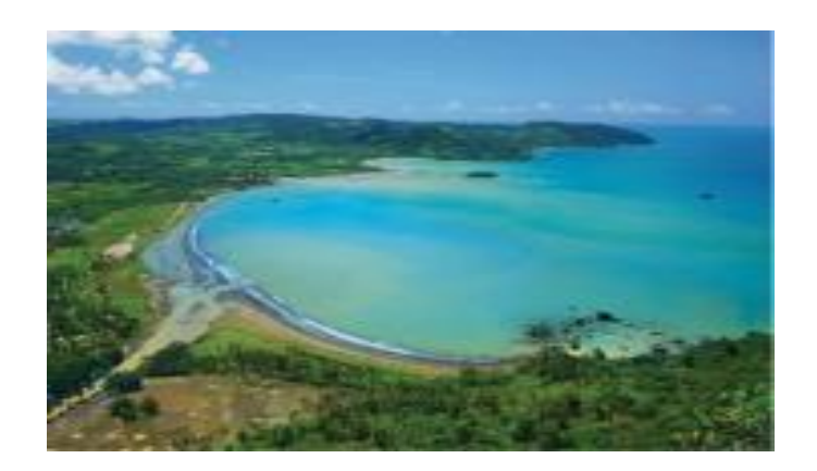
FIGURE 1. THE MAGICAL OF CILETUH AMPHITHEATER