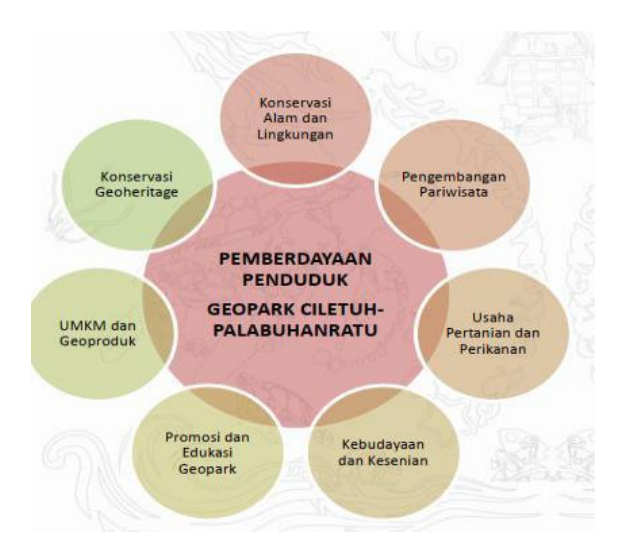
FIGURE 3. EMPOWERMENT CONCEPT APPLIED IN CILETUH-PALABUHARATU