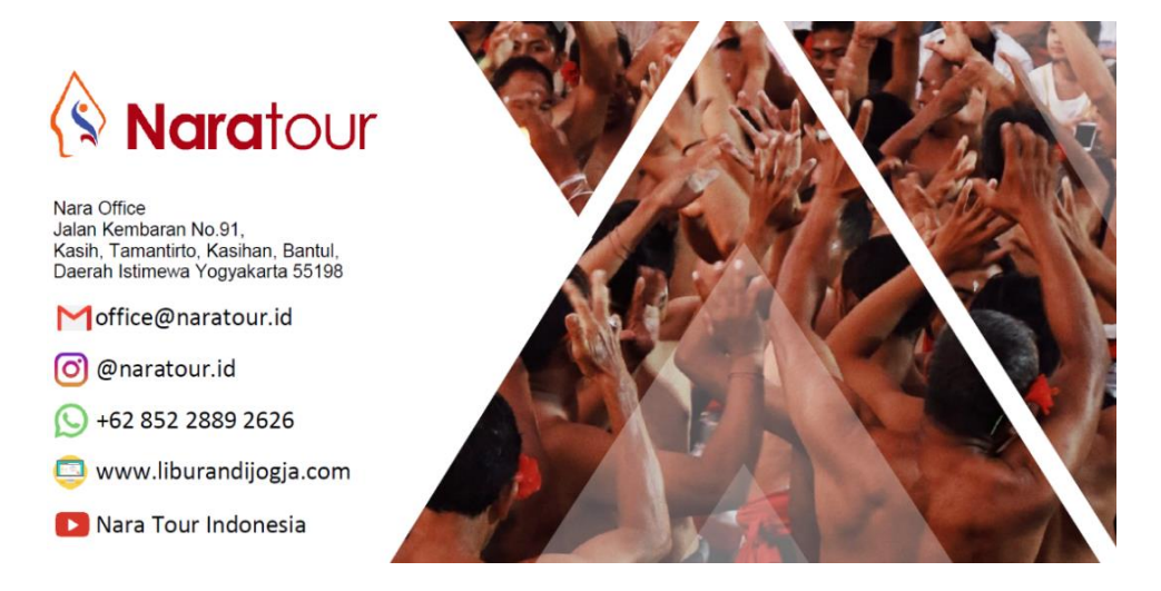
FIGURE 2. CV Nara Tour Organizer's Profile