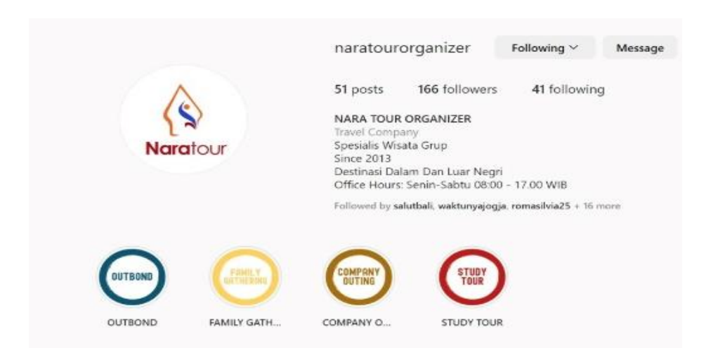
FIGURE 5. Marketing through Instagram (Before)