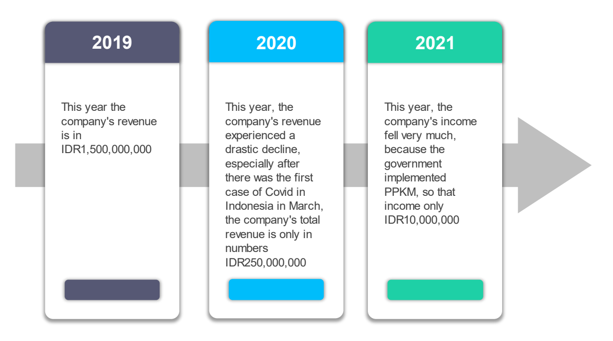
FIGURE 3. CV Nara Tour Organizer's income from before and during the pandemic