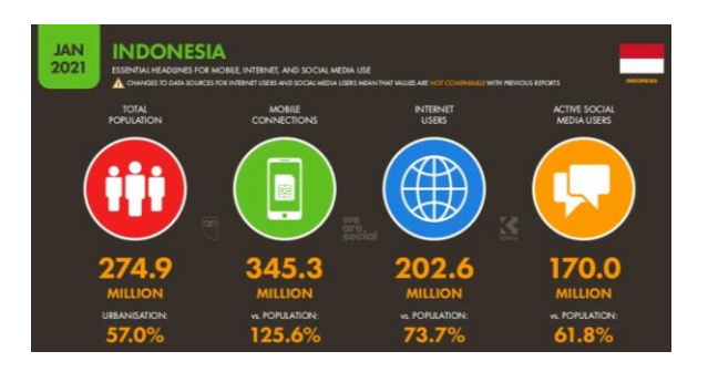
Figure 2. Data digital Indonesia (Datareportal, 2021)

use social media every day for about 8 hours (Datareportal, 2021). The information retrieved spatially can be identified from the results of postings, tweets, and other internet usages. The analytics software in GEOINT can filter out this large volume of unstructured data and visualize it in geographic and temporal contexts.