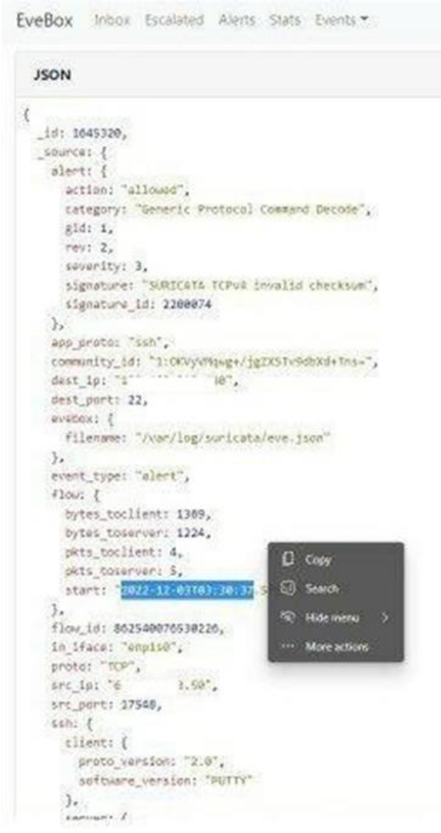
Figure 8. Analysis of Bruteforce attacks on SSH ports

The last attack, which flooded packet data containing several types of malware, was identified through one of the alerts in Table 3. One of the logs was taken, and its hash value was found to be for the push.do Trojan malware with SHA 256 and SHA1 values. VirusTotal provided information that the malware file is an executable with a size of 836kb and is highly dangerous since it can execute attacks once it has infiltrated the web server, without waiting for the attacker to activate it, which can compromise network security. Figure 9 displays the result of the hash value analysis on VirusTotal, which indicates that out of the 67 antivirus programs, 50 classified the sample malware as a Trojan and thus highly dangerous.