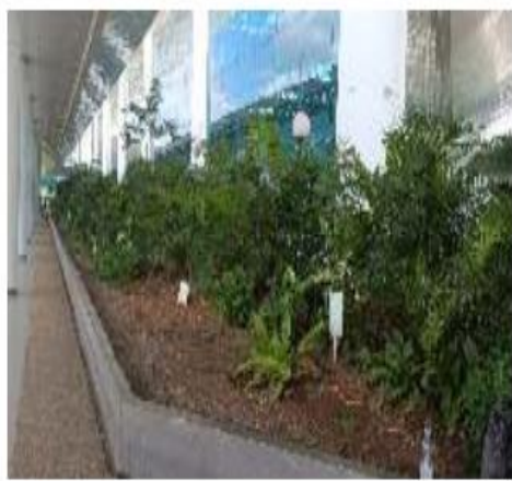
Figure 6. Green Open Area in the Terminal Area

e. Bicycle Parking and Shower Compartment Bicycles as a mode of transportation that is clean and does not cause air pollution and does not use fuel are supported by its existence by Syamsudin Noor Airport by providing bicycle parking facilities and shower compartments in toilets for the bathing needs of employees who use bicycle transportation modes.