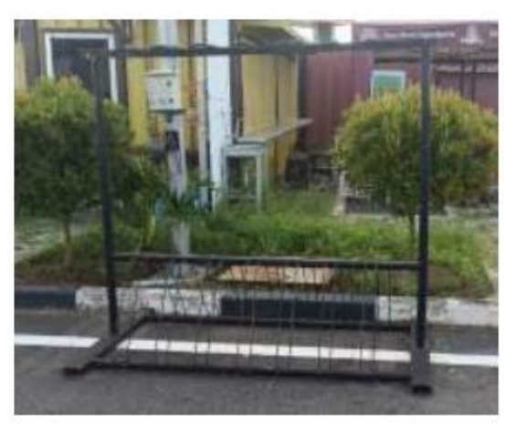
Figure 7. Bicycle Parking

e. Bicycle Parking and Shower Compartment Bicycles as a mode of transportation that is clean and does not cause air pollution and does not use fuel are supported by its existence by Syamsudin Noor Airport by providing bicycle parking facilities and shower compartments in toilets for the bathing needs of employees who use bicycle transportation modes.