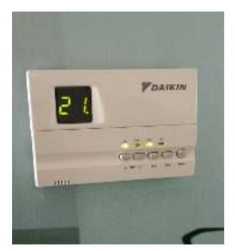
Figure 8. Room Temperature Control