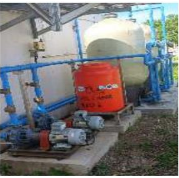
Figure 5. Wastewater Treatment

A wastewater treatment facility that recycles used dirty water into suitable water for garden flushing and toilet flushing. Dirty and residual water is not immediately discharged into the sewer, but the water is reprocessed into STP (sewage treatment plant). STP (sewage treatment plant) is a liquid waste treatment plant intended for household waste such as sewage, used water to wash dishes or clothes, and also dirty water from kitchens and bathrooms. Meanwhile, Water Treatment Plant is a water treatment plant to obtain water that complies with quality standards and separates it from contaminants to make it cleaner and safer for consumption. This is to minimize the need for clean water. Recycled water has its own pipe installation system, separate from the clean water installation system with its utilization that has currently been carried out, which is reused for watering plants and operational car wash water sources.