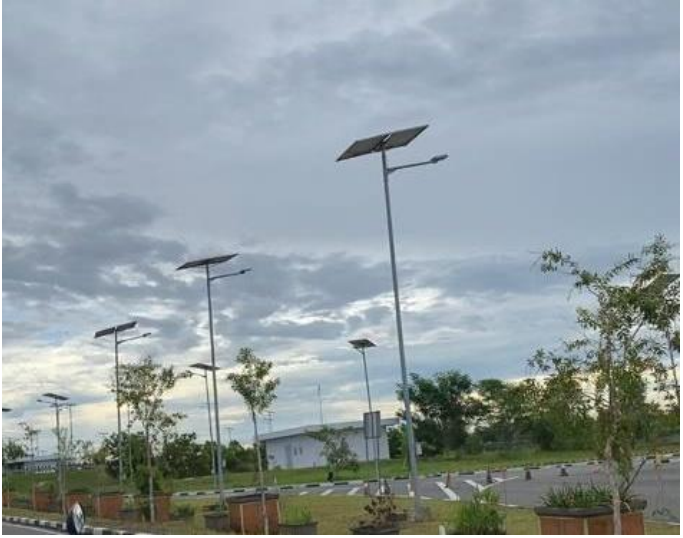
Figure 3. Solar Panel

In addition to electricity from PLN, Syamsudin Noor Airport utilizes sunlight to be converted into energy. There are 2 electricity generated from solar panels, namely electricity on grid and of grid. On grid electricity is electricity generated by solar panels that is directly flowed to equipment that requires electricity. While the electricity of the grid, which is produced by solar panels, is stored in batteries, then the electricity is used for lighting at night and as a backup if the weather is not hot.