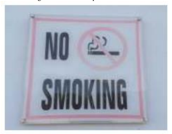
Figure 9. No Smoking Sign

The application of the green building concept is the comfort of airport flight service users. Comfort and feeling of comfort are a comprehensive assessment of one's environment. Humans judge environmental conditions based on what enters them through the sense of nerves which are then digested by the brain to be assessed. In this case involved not only physical and biological problems, but also feelings [8]. This is supported by research conducted by Safarin which shows the results that the application of the green building concept affects the comfort of service users at Banyuwangi International Airport. This is shown from the results of the calculated t test of 12.268 with a significance value of 0.000. The application of the Green Building concept has an influence of 68.9% on the comfort of service users, while the other 31.1% is influenced by other factors outside the Green Building concept. This shows that the application of the green building concept at the Banyuwangi International Airport terminal has a very strong role in terms of increasing the comfort of service users, so the airport must play an active role in reviewing the shortcomings in the application of this concept [13].