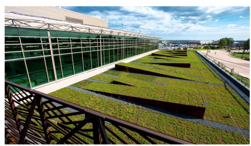
Figure 10. Green Roof at Minneapolis Airport

The use of green roof at the airport has been applied to Minneapolis St. Paul International Airport and can be seen in the picture below: