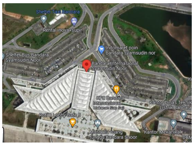
Figure 1. Syamsudin Noor Airport

Syamsudin Noor Airport continues to strive to implement the concept of green building in the context of concern for the environment. In figure 2, you can see the factors causing problems in implementing the green building concept at Syamsudin Noor Airport as below: