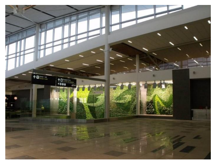
Figure 11. Vertical Garden at Alberta Provincial Airport Canada