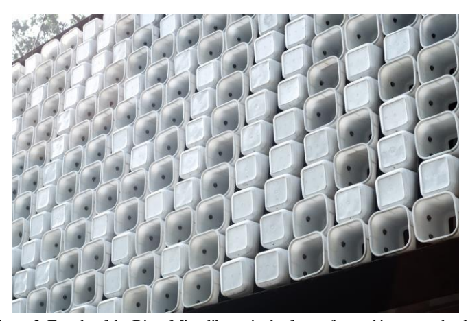
Figure 3. Facade of the Bima Microlibrary in the form of a used ice cream bucket

Bima Microlibrary was built using a steel structure and concrete slabs for floors and roofs. Since the building is located in a tropical climate, SHAU aims to create a pleasant space without the use of air conditioning. Therefore, materials in the surrounding environment are used which are cost effective, can shade the interior, natural lighting and cross ventilation in the form of 2000 used plastic ice cream buckets as shown in Figure 3.