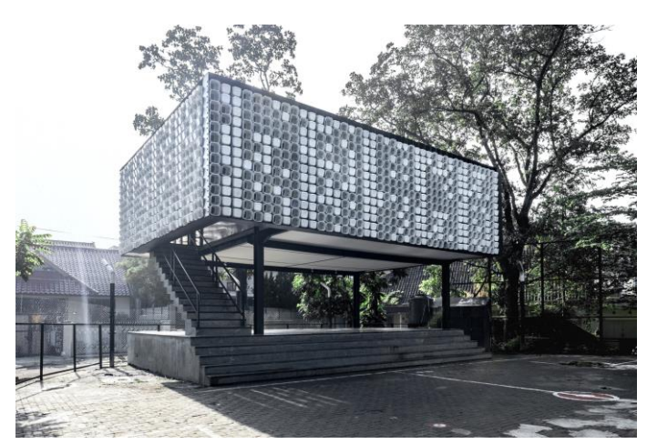
Figure 2. Bima Microlibrary, Bandung

Recycled materials in buildings are also used by SHAU architects (Suryawinata Haizelman Architecture Urbanism) Indonesia in its design are the Bima Microlibrary in Bandung shown in Figure 2.