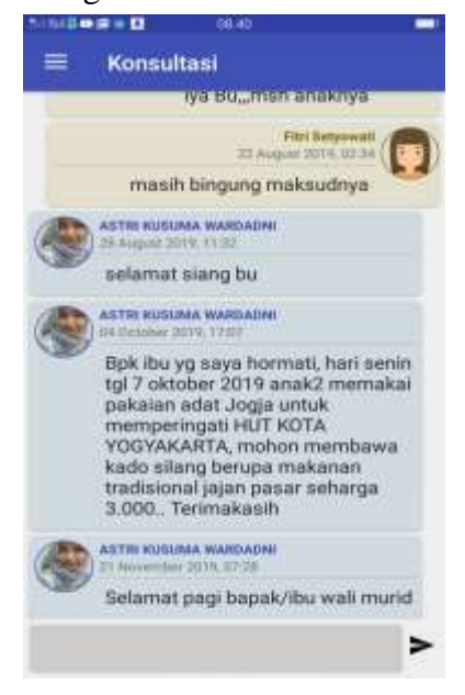
Fig.4. Violation Menu